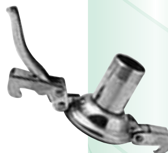
SFERICO - SPHERIC FITTING