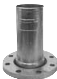
EN 1092 (UNI) - ASME (ASA)